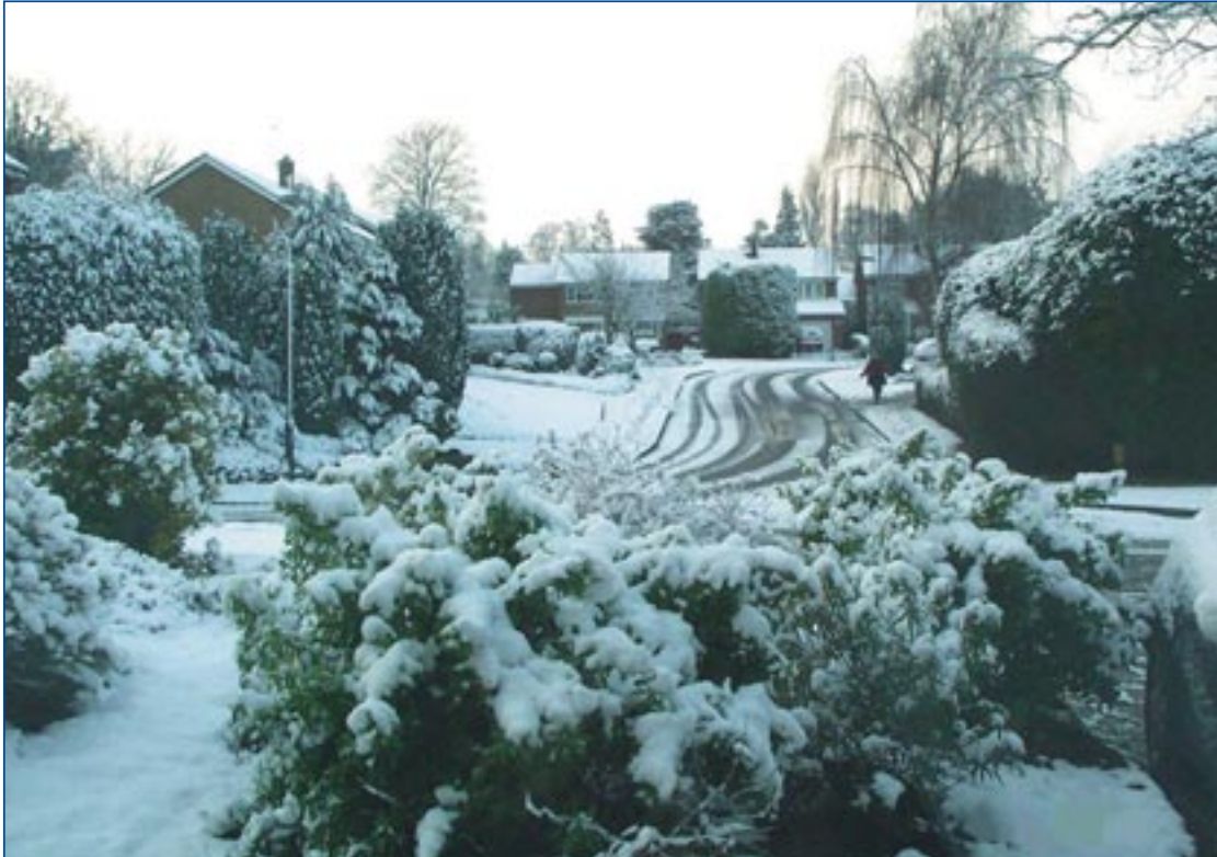
Pembury was shrouded in deep snow in February – view of the Ridgeway