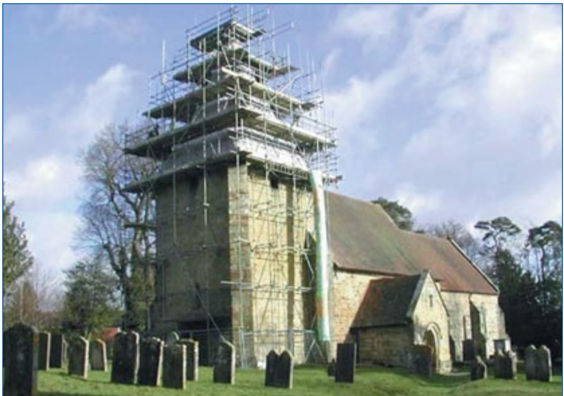
Old Church undergoes a refit (also in February, but with sunshine!)