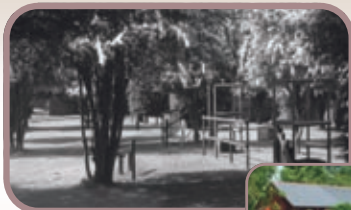
New Hay Farm, Old Hay Paddock Wood, Kent TN12 7DG T: 01892 83 4306