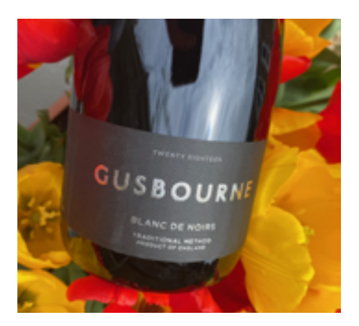
Alternatively, pair a pink version with summer salads involving charred peaches, toasted walnuts, and chunks of creamy burrata.

Sparkling stunners: A quick note on sparkling wine terminology: 'traditional method' is the same as Champagne. The difference? Very little except for price (and grape provenance). 'Champagne' marketing masterclass known is a the world over as the celebratory fizz. This means a traditional method Kent sparkler is but a fraction of the price compared to the French equivalent. Expect a racing acidity with deliciously pure citrus and orchard (Chardonnay) or berry (Pinot Noir/Meunier) fruits, on a back-bone of toasted brioche from its ageing requirements. A simply perfect accompaniment as a sunset aperitif or with any rich starter/main course combo - you'll be surprised of their versatility.